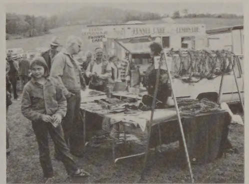
A county fair atmosphere prevails at Wild Horse and Burro Days.